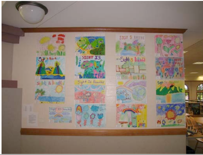
Photo of some of the winners

In the Fall of 2004, the Kauai North Shore Lions Club sponsored their annual "Sight is Beautiful" poster contest at Hanalei and Kilauea Elementary Schools. Each student was asked to create a poster with a theme of "Sight is Beautiful" to emphasize the miracle of sight.